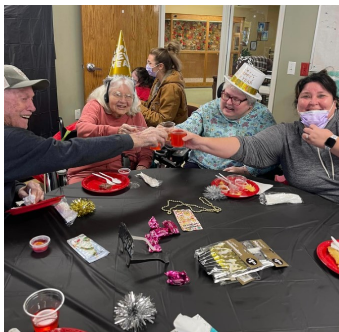
2024 New Year's Party was so much fun! Thank you, to everyone who celebrated with us!