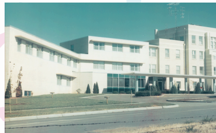
Memorial Hospital 1960's