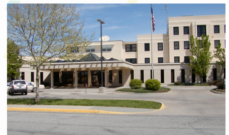
Memorial Hospital - 2002