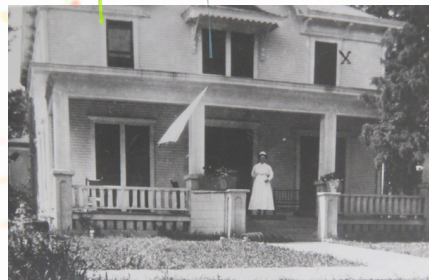
1890's Carpenter house 107 W 1st. First hospital in Abilene (still stands)