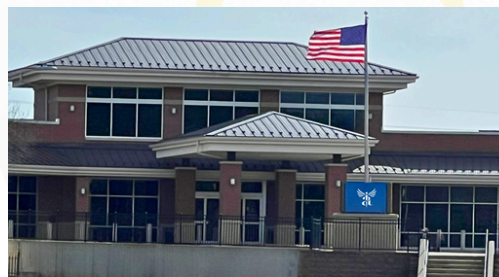
Memorial Health System 2026