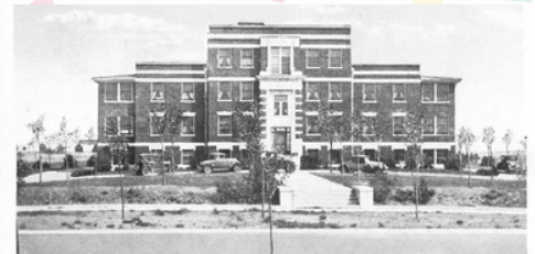
Hospital District No.1 of Dickinson County KS - 1922